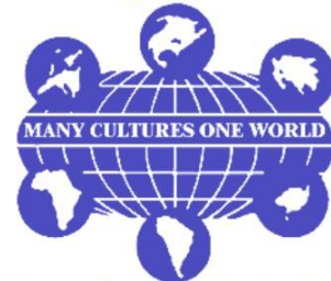
Transcultural Nursing Society